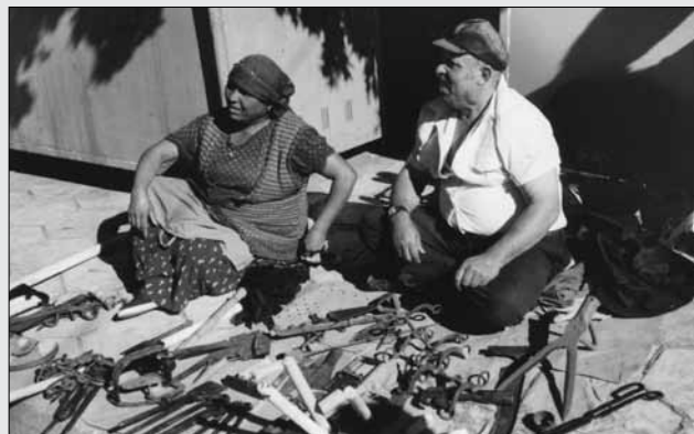
III. 18 Burgudžii/Parpulii , Bulgaria 1998

various countries in Western Europe to permanently settle there (or at least with the intent to settle). At this stage the relations (including through marriage) among the members of the groups