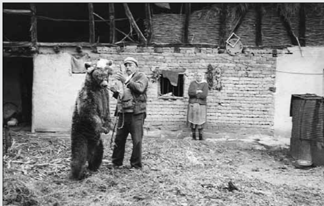
III. 5 Romanian speaking Ursari (Subgroup of Rudari) in Bulgaria 1998