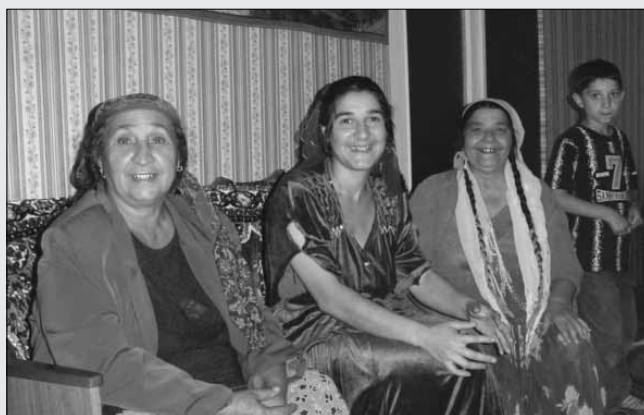
III. 16 Kelderari , Ivanovo, Russia, 2004