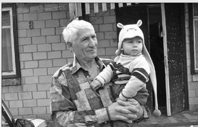
III. 15 Ruska Roma , city of Prejaslav Khmelnytskyi, Ukraine 2003

and Latvia. These two groups are divided into internal subdivisions: among Lovari these are Ungri , Čokešti and Bundaša ; among Kelderara - Serbaja , Moldovaja , Grekurja , Bugari , Dobrožaja , Mačvaja , Mihaešti , Ionešti , Bidoni , etc. The trend (in most cases still ongoing) among Kelderari is towards segmentation of separate subgroups into new groups. Currently, the furthest developments in this direction are to be observed in the case of the so-called Šanxajci or Kitajcurja or Kitajako Rrom who live in Odessa. In the countries of the former USSR there are also Romanian-speaking Roma, such as Lingurari , living in the contemporary Republic of Moldova and Bessarabia; a significant part of them migrated also to Ukraine and the Russian Federation. The Vlaxija in the Republic of Moldova are also Romanian-speaking. Both groups have a preferred Moldavian/Romanian identity.