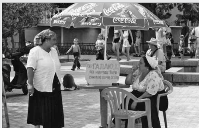
III. 8 Krimurja/Kırımlıtica Roma , Muslim Roma from Crimea, Crimea, Ukraine, city of Aluşta 2002