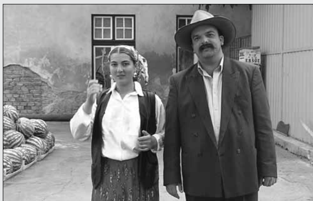
III. 11 Gabori , Cluj, Romania 2003

community, known under the generalised name Lăeši and/or Pletoši and Kortorari . Within this metagroup community, the relatively well-preserved groups and subgroups are e.g. Kălderari , Zlatari , Čurari , Gabori , Kazandži , Aržentari , Korbeni , Modorani , Tismanari or Čori , who belong to the Vlax II dialectal group. In Romania there are also groups linguistically classified as part of the Balkan dialect group ( Ursari , Spoitoari ), and in Dobruzhza there are Turkish- or Tatar-speaking Muslim Roma with their respective preferred identity. Transylvania home to a significant number of Romani-speaking Rumungri ( Roma Ungrika ), part of them are Hungarian-speaking Rumungri , often with a preferred Hungarian identity. In central Europe the variety of Roma groups is smaller relative to the one in the Balkans and in Romania. In Slovakia, a large Roma population has been settled for centuries, divided most generally into the Slovenska (Slovak) Roma (also called by some scholars Servika Roma ) speaking Central or Carpathian dialects of Romanes, and Ungrika Roma or Rumungri , many of whom are only Hungarian-speaking and some of whom have a preferred Hungarian identity. This is also the home of Vlašika or Olah (Wallachian) Roma (their number there is smaller) from different subdivisions - Lovari , Bougešti , Drizdari , etc., who are former nomads, speaking northern Vlax dialects. Moreover, we find small communities of Romanian-speaking Bajaši or Ko-