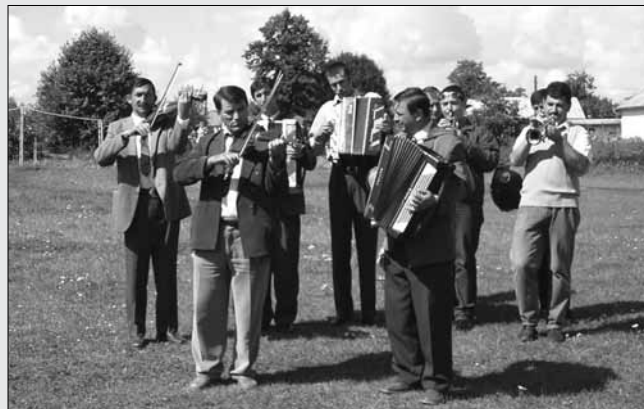
III. 6 Ukrainian speaking Roma with preferred Ukrainian identity, from village Hlinicja, Ukraine, 2003