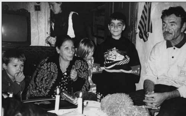
III. 17 Kaburdži , Albania 1999