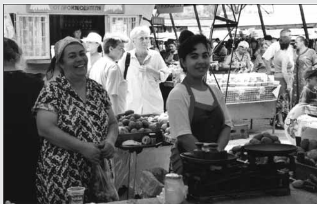
III. 12 Dajfa , Simferopol, Ukraine 2002