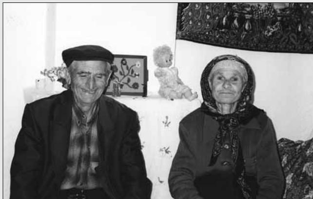
III. 10 Mečkari , Baltëz, Albania 1999

contemporary migrants or descendants of the migrants who left this region from about 150 years ago). Sinti in this region are too few in number, as they comprise only a few families in the Russian Federation, Poland, Hungary, the Czech Republic, Slovakia and Slovenia which are nowadays mostly mixed with Roma. From the point of view of borders of the Roma subdivision presence, the territory of contemporary Turkey has a unique place in the world. It is the current location of the heirs of the three big waves, into which the Romani migration was divided during their long journey from India to Europe (the division “ Rom / Lom / Dom ”).