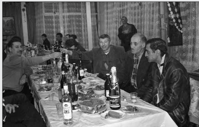
III. 14 Servi , city of Prejaslav Khmelnytskiy, Ukraine 2004

rytari . The situation in the Czech Republic mirrors the situation in Slovakia because during the Second World War the local Roma and Sinti were almost entirely annihilated in Nazi concentration camps (only a few families survived). After World War II, the country was repopulated by Roma who came from Slovakia (primarily from the region of eastern Slovakia). In Hungary the settled Rumungri ( Ungrika Roma ) and/or Ciganyok are predominant. Most of them are Hungarian-speaking, many of them also with a preferred Hungarian identity. One may also encounter Romani-speaking groups of Rumungri , although they are less numerous (mostly in Eastern Hungary), as well as a minor presence of Slovenska Roma . The second most numerous community are the Vlašika Roma or Olah Roma with internal subdivisions into Lovari , Kelderari , Čurari , Drizari , Posotari , Kherari , Čerhari , Khangliari , Colari , Mašari , and others. The third community is the Romanian-speaking Bojaši , with internal subdivisions into Ardelan , Muntjan , Titjan , etc.). Among some of them there is an on-going process of developing a Roma identity. Poland is a country with a relatively small number of Roma. In the regions which used to be part of the former Russian Empire live the Polska (Polish) Roma , former nomads who are now scattered all over Poland. Their community also includes the so-called Xaladitka (or Ruska ) Roma who live in areas bordering the former Soviet Union, as well as their