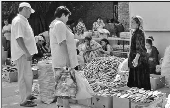
III. 13 Vlaxi/Vlaxurja women, Astrakhan, Russia, 2003