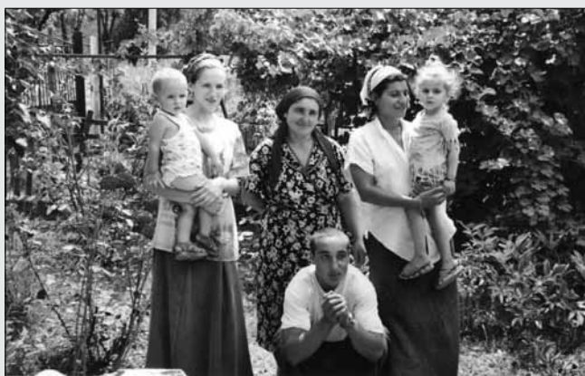
III. 7 Kurbeti , town of Voinka, Crimea, Ukraine, 2002

Generally it can be said that Roma form a specific type of community, "the intergroup ethnic community" which is divided into a number of separate (and sometimes even opposed) endogamic groups, subgroups and metagroup units with their own ethnic and cultural features. On the basis of the "Roma group" it is possible to reveal the different levels of existence of the Romani community - group, subgroup divisions and metagroup units on different levels. These communities are on different hierarchical levels, and depending on various factors, one or another of these levels could be the main, leading or determining factor of the identity of any given Roma community, including the consciousness of affiliations to a civic nation-state