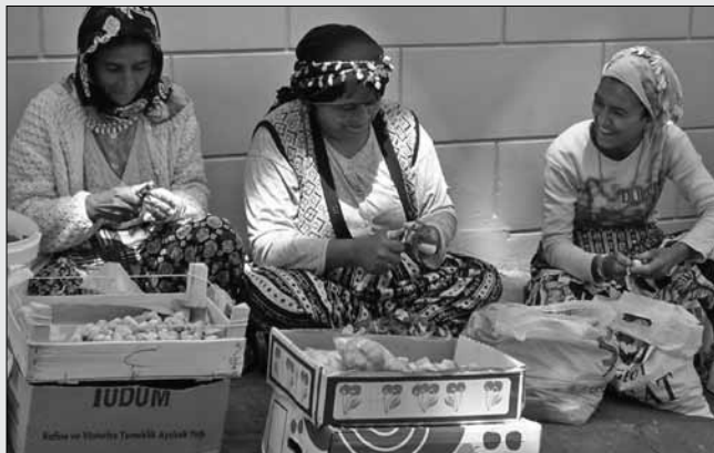
III. 9 Sepedži , Izmir, Istanbul, Turkey 2006